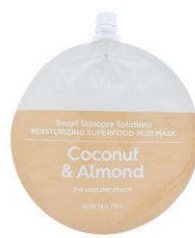
Coconut & Almond Moisturizing Superfood Mud Mask