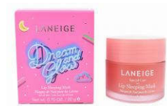
Lip Sleeping Mask