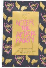
After The After Party Recovery Face Mask