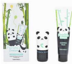
Day & Night Duo