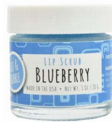
Blueberry Lip Scrub